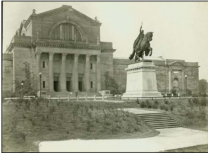
Saint Louis Art Museum

The project was supported by the Institute of Museum and Library Services (MLS), under the provisions of the Library and Technology Act as administered by the Missouri State Library.