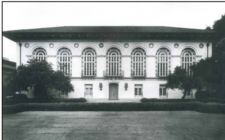
Library (Battle Hill) at the University of Texas, 1911 Photograph from Cass Gilbert, Life and Work, Architect of the Public Domain