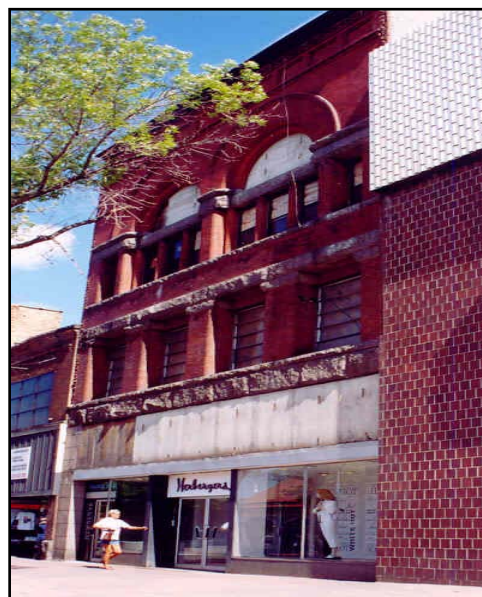
Kerr Block in 2003

November 10-12 Cass Gilbert Society tour to Austin, Texas (see inside)