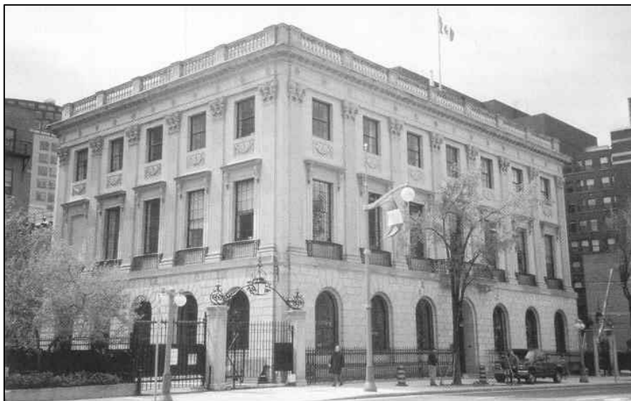
United States Embassy, Wellington Street, Ottawa, Canada.

Gordon D. Giffin, U.S. Ambassador to Canada between 1997 and 2001, spoke fondly of the building. He recalled seeing school children leave the House of Commons from the windows of his second-floor office suite, which he called "a window on Canada." He suggested its reuse as a place for the study of Canadian government or history. In 2001, the Liberal Jean Chrétien government announced that a national portrait gallery would be established in the building. Designs for reuse and the construction of an addition were made in 2003, and most of the interior was gutted. When the Conservative government was elected in 2006, plans were halted. Instead, it sought to move the portrait gallery to another Canadian city, but then cancelled that plan last November. Senator Grafstein is promising legislation to revive the Canadian portrait gallery in the former embassy. Ambassador Giffin concluded: "It's a grand old building. I certainly hope that Canadians enjoy it and utilize it in a way that respects its history and architecture so that it will be a vibrant place to remind people of our joint heritage."