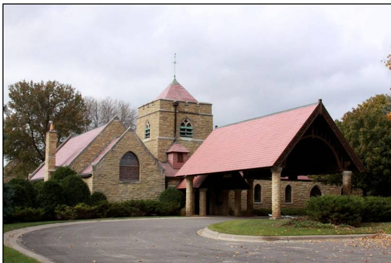
Roselawn Cemetery Chapel.