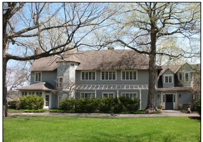
At left: Tarbox House in 1891; At right: Tarbox House in 2011