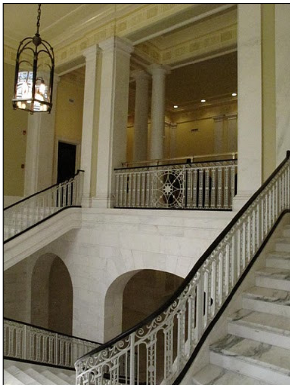
Waterbury Municipal Building Interior Staircase